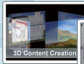
3D Content Creation