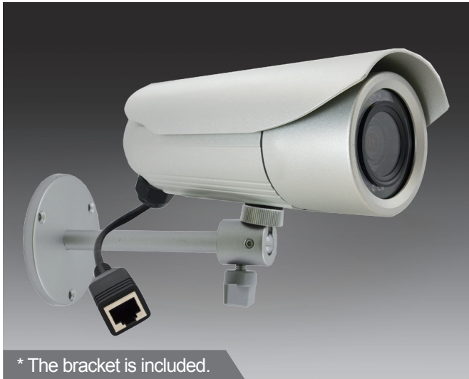
* The bracket is included.